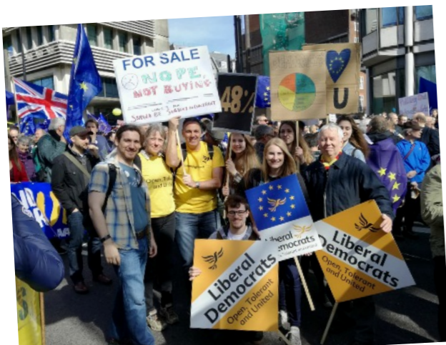
Lib Dems en marche! The Dacorum contingent marching for co-operation and freedom.