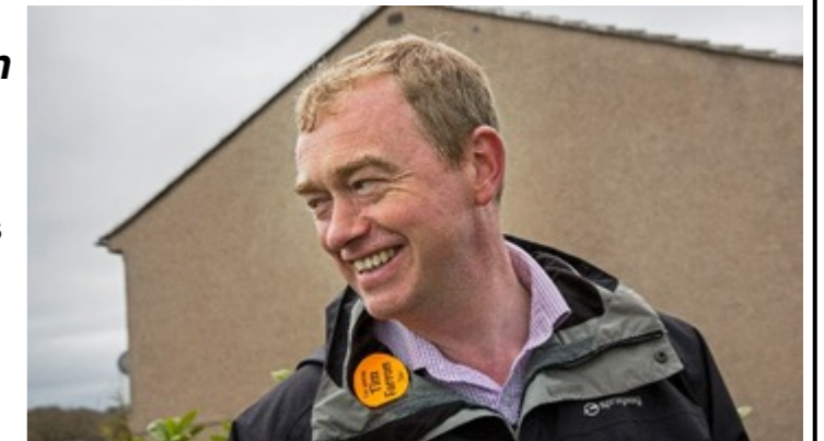
Tim Farron MP, Leader of the Liberal Democrats

Under their new leader, Tim Farron MP the Liberal Democrats have recovered from the hard knocks of the General Election. Membership has steadily increased from that point and is now in excess of 84,000. Locally and nationally the Liberal Democrats have been winning by elections, from a seat on Berkhamsted Town Council last February to the Parliamentary seat of Richmond Park before Christmas. And along the way we won the council by election of Gade Valley and so regained control of Three Rivers District Council.